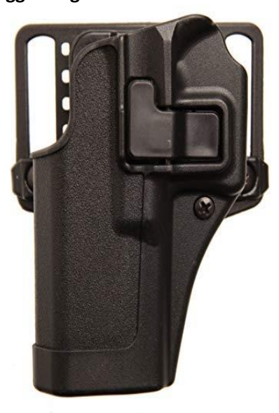
Not Allowed – Trigger finger button release holsters such as SERPA

"Permitted Slings" means - for use on a range with a rifle, pistol carbine or shotgun, any two point-connection sling; a single connection sling, sometimes called a tactical sling is not allowed; carrying a rifle, pistol carbine or shotgun on a sling, to and from the Firing Line to the targets is not permitted (they must be racked or cased)