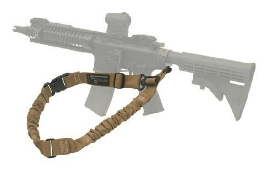
Not Allowed - Tactical slings (one point hook-up to firearm)

"Permitted Slings" means - for use on a range with a rifle, pistol carbine or shotgun, any two point-connection sling; a single connection sling, sometimes called a tactical sling is not allowed; carrying a rifle, pistol carbine or shotgun on a sling, to and from the Firing Line to the targets is not permitted (they must be racked or cased)